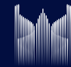
THE DUBAI FOUNTAIN

The spectacular neighbourhood of Arts and Culture